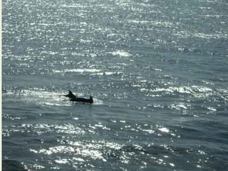
Dolphins of Little Brother