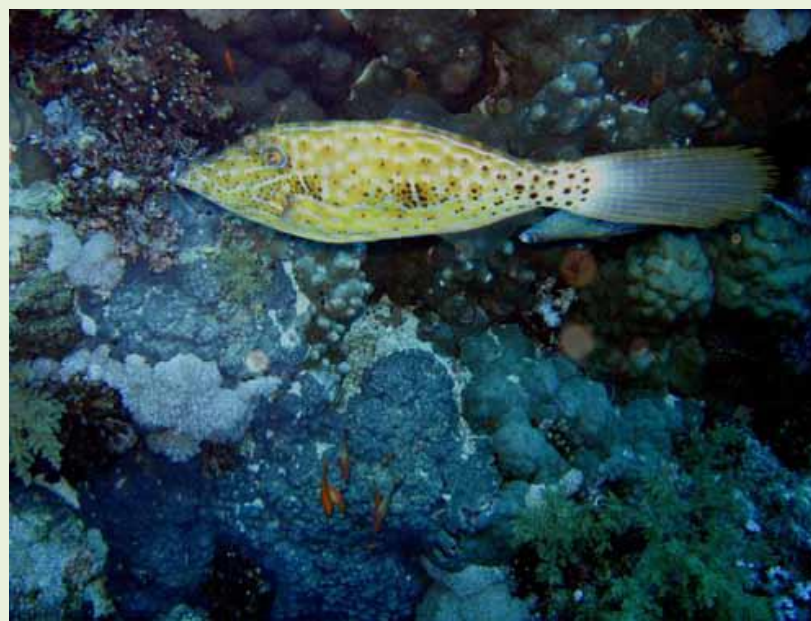
A File Fish, odd looking creatures