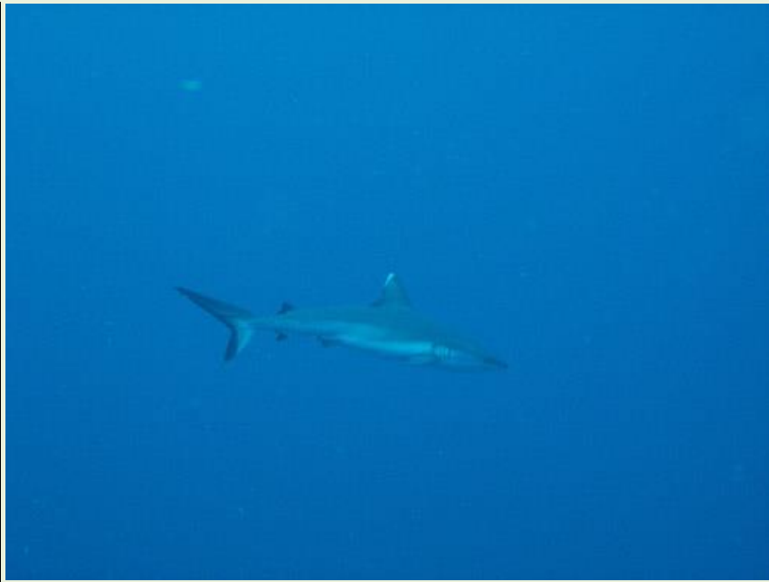
Another Grey Reef at little Brother