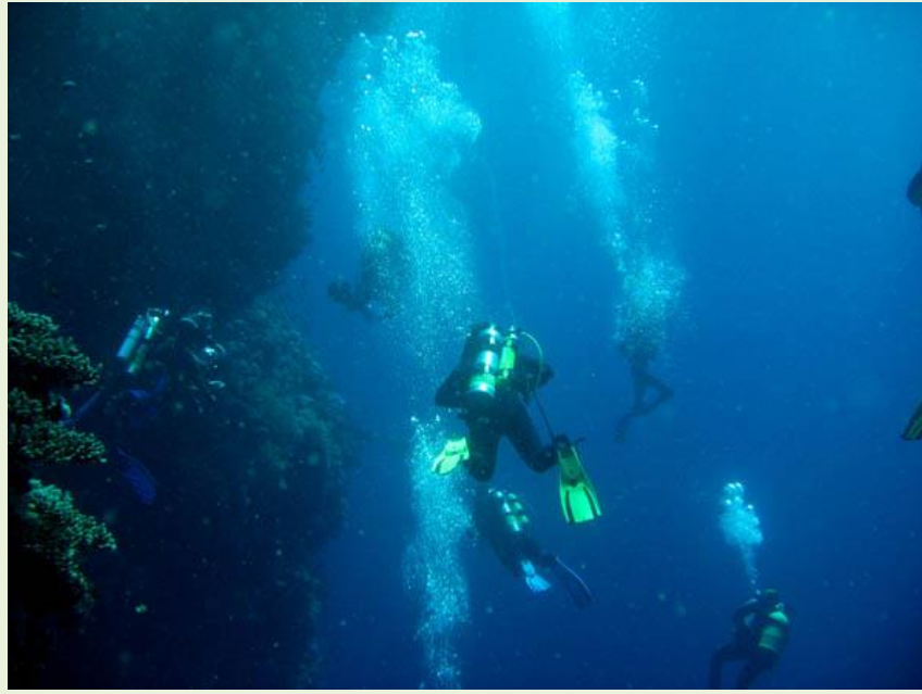
Swimming the wall at Big Brother after leaving the Numidia