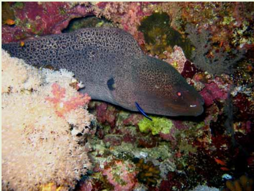
Moray with Cleaner Wrasse in attendance