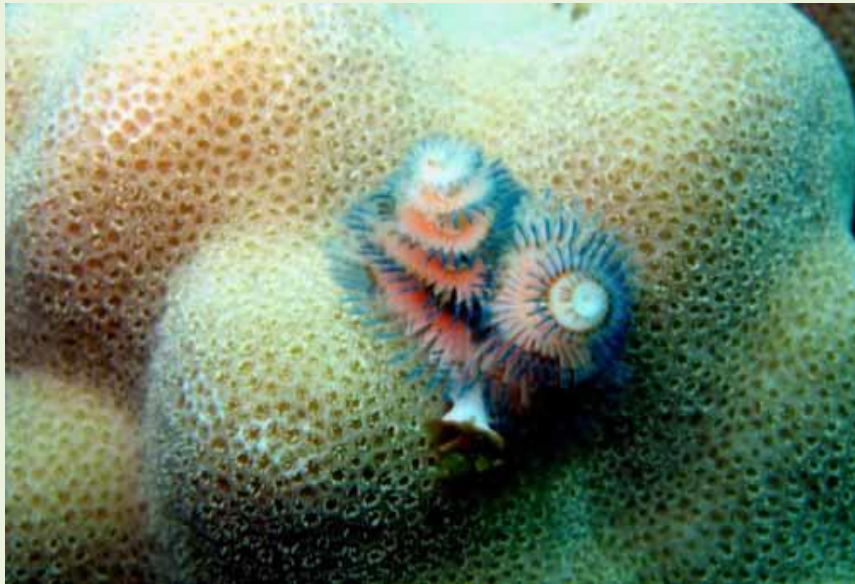
Christmas Tree worm