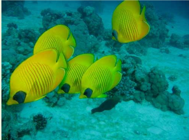
Butterfly Fish at Gota Abu Ramada