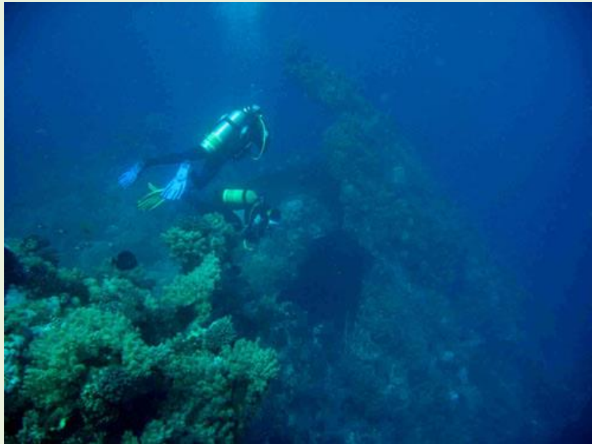
Dropping down onto the Numidia