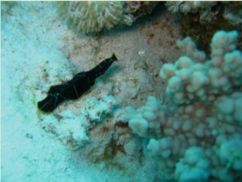
A Nudibranch of some type