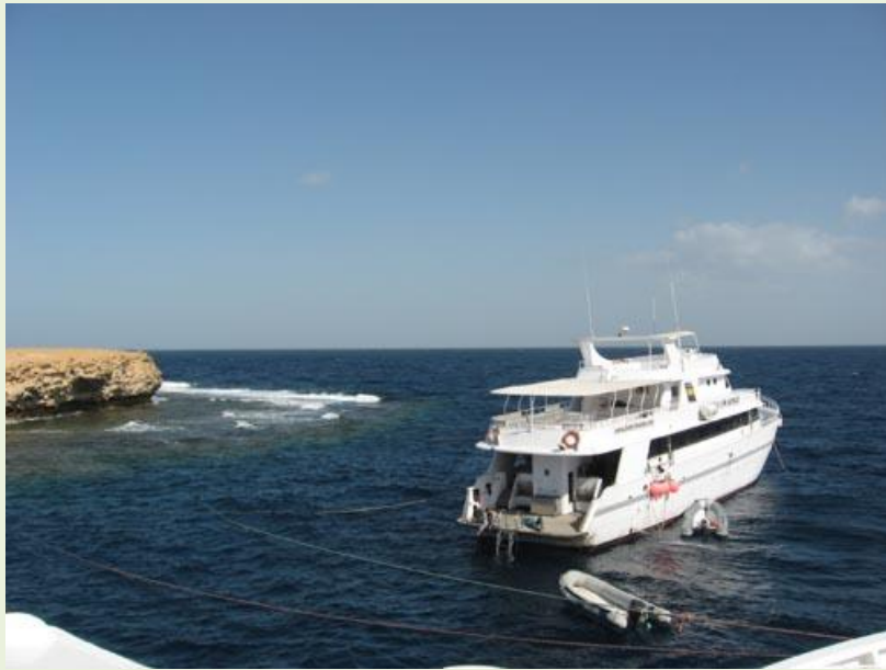
Anchored off Little Brother