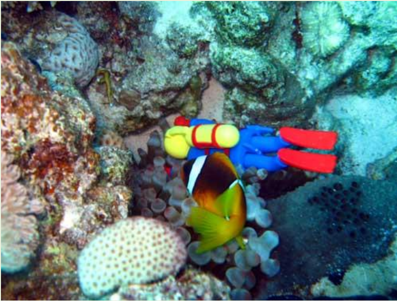
Captain Nemo makes his first appearance with Clown Fish