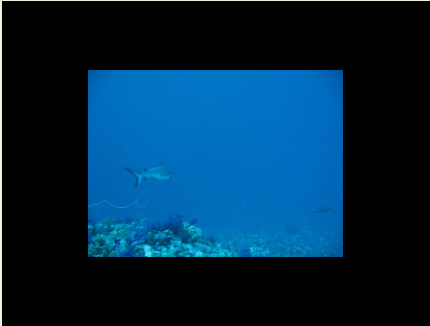
Grey Reef Shark off the Northern tip of Little Brother