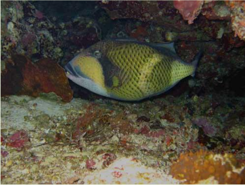
A Titan Trigger Fish trying to hide