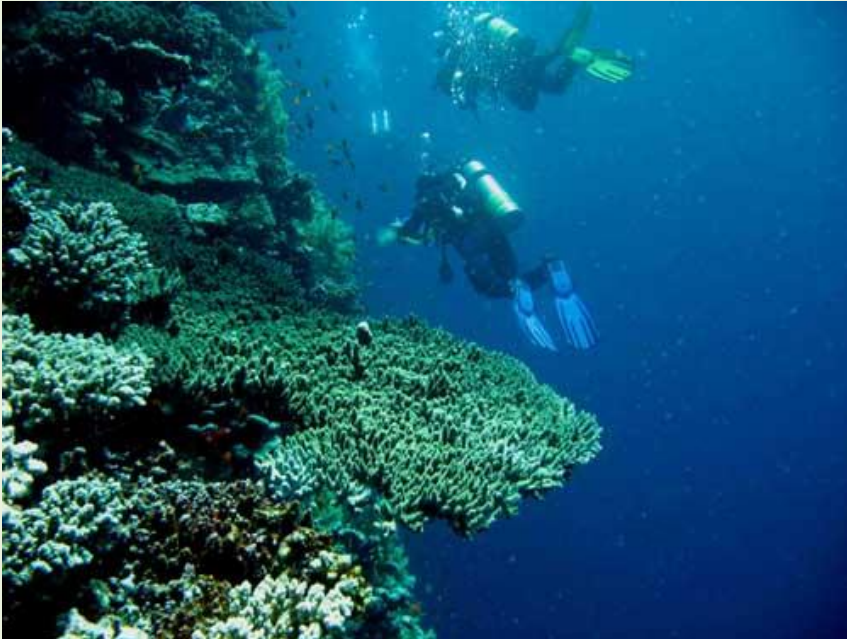
Reef wall on Little Brother