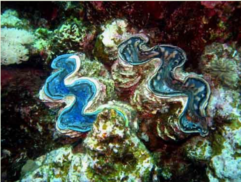
Colourful Giant Clams