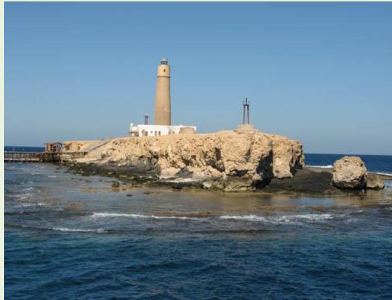
Big Bother with lighthouse and jetty