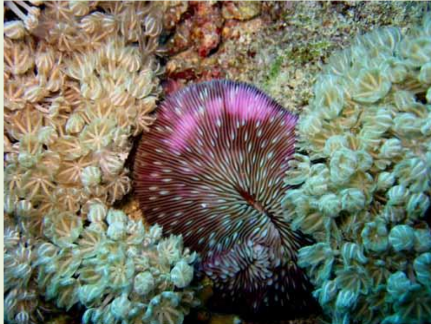
Not sure what this is but the colours were striking