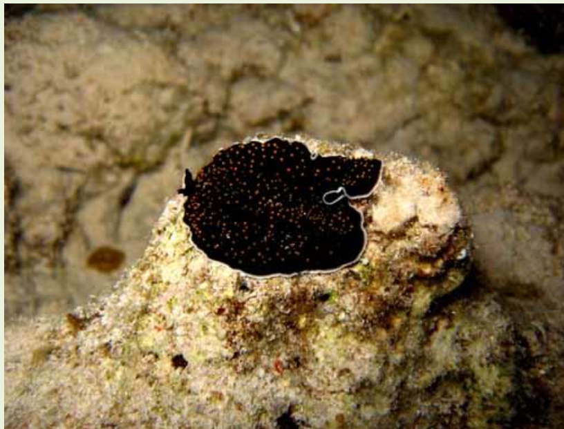
A different type of Nudibranch found on the night dive