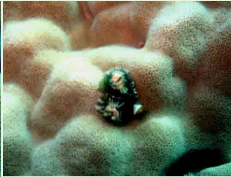
Another Christmas Tree worm