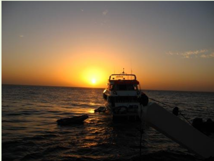
Sunset at Little Brother