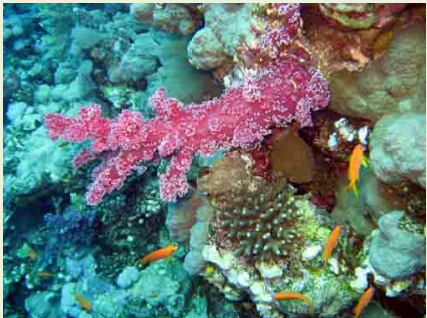
Pretty Soft Corals somewhere on the Brothers