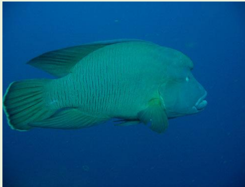
A very large Napoleon off Little Brother