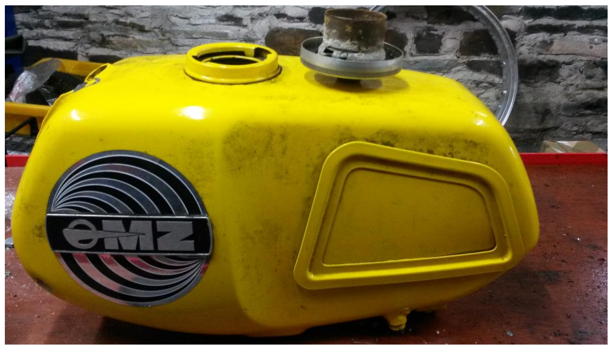
hopefully in a week or so the bits will arrive.

The only other development has been on the ETS150 petrol tank front. Steve Edwards finally sent me some pictures of his spare tank (which is yellow very conveniently). Looks to be in quite good condition so we concluded a deal which included a rebuilt TS150 crankshaft. The cheque is now on its way and