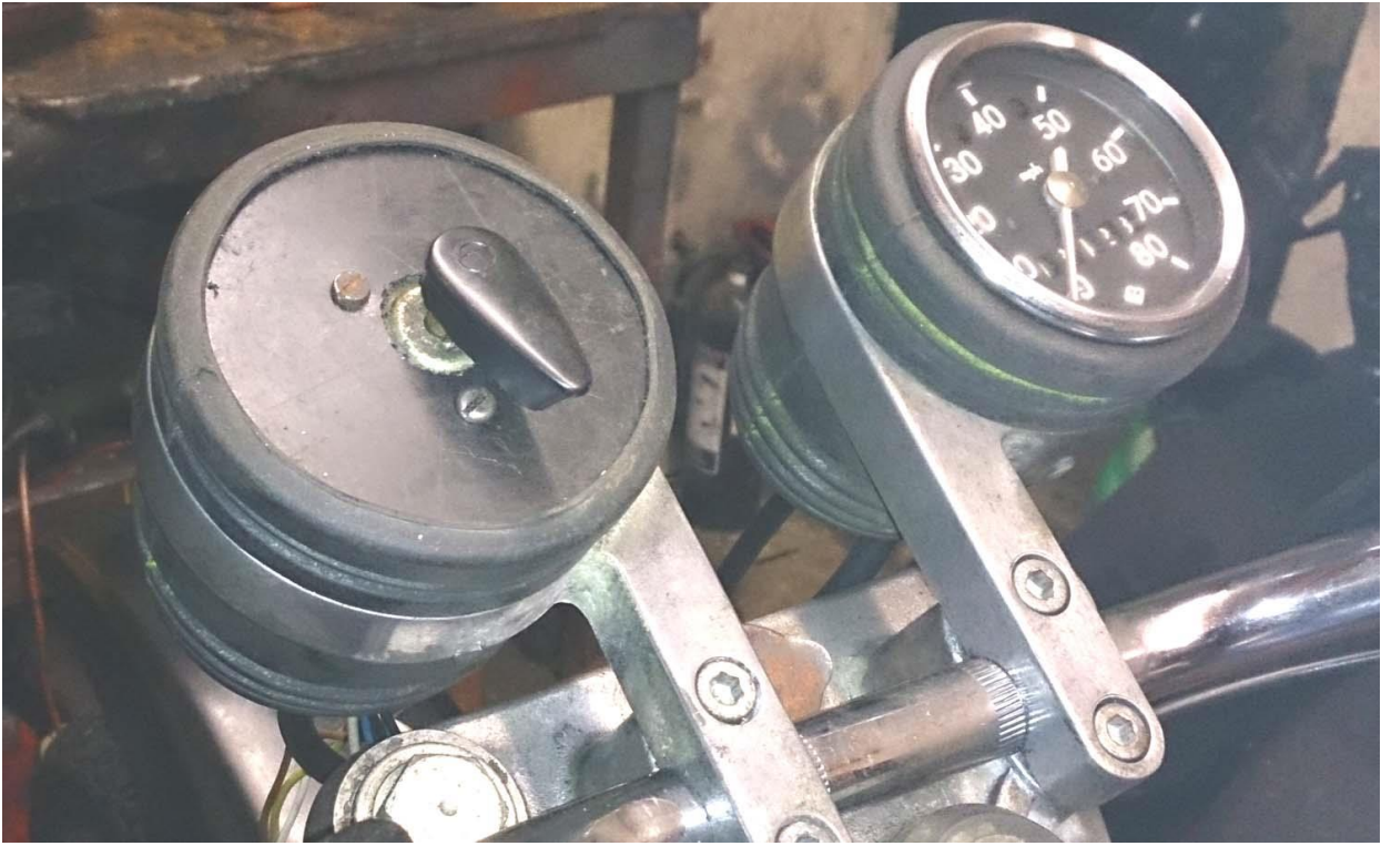
and the horn needs attention. I will need to wrap the new loom in due course but probably best to leave that for a while in case I find I missed anything.

Overnight I had a brainwave on how to wire the Trail TS150. The issue had been where and how to site the ignition switch given that I had junked the original headlamp. The solution was I think neat and practical. I had already junked the tacho but it rubber housing, with a circular plastic cover for the top provides a waterproof unit. Drilling a few holes in the plastic cover provided a mounting for the switch. I had already disassembled the majority of the wiring harness so I was able to use the original wires but in a new configuration to suit the new switch location. By lunchtime I had a everything in place and tested electrically though I have yet to acquire a headlamp, the tail light assembly is not yet installed