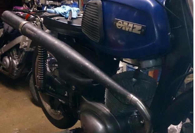
up but which I will weld together once I am confident I have the optimum location.

exhaust pipe until it was more or less the correct shape. It was then tack welded whilst I offered up the silencer in roughly its ideal location. With a bit more fiddling I got a passable result and started to weld up the pipe. However tackling thin metal with my arc welder even on its lowest power setting did not prove too successful so I will have to make another visit to Mick the