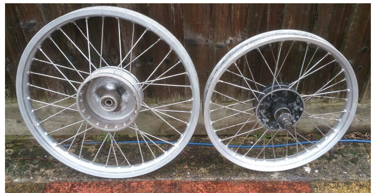
the front rim from the Trail TS150 and rebuilt the disk brake wheel as well. I don't have a particular need for such a wheel at present but it's more likely to be useful in this form than as a set of parts.

Feeling quite pleased with myself after today's efforts. Tidying up the garage and sheds I found a new 21" aluminium rim which I was given years ago. I also found a box of old spokes removed from previous wheel rebuilds including a set for the 21" wheel of my old ISDT bike. The original front wheel from the trail TS150 had very rusty spokes and was generally pretty mucky so I dismantled it all and cleaned up the hub which came up fine. An hour later I had a 21" rim laced to an MZ front hub. Took me another hour to true it up but the end result is pretty good. Now I need to find a suitable tyre and tube. I also found an MZ disk brake hub which had donated its rim to a good cause some time ago so I cleaned up