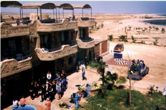
View of the dive shop. In the top left is the jetty where the cruiser Pensee was moored for our trip in 1995