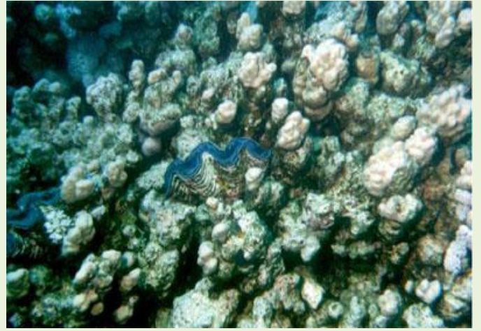
Large Clams. The inside colours are vivid,