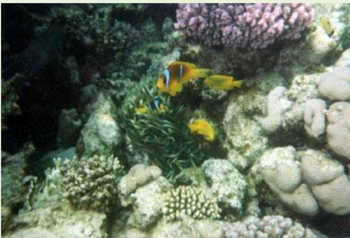
Clownfish and nice coral

The pictures were all taken with my Nikonos 5 camera (and an Ikelite Strobe for the u/w scenes). They were scanned at fairly low resolution from the original prints in 2003 so they are pretty dire. This is just a small selection: