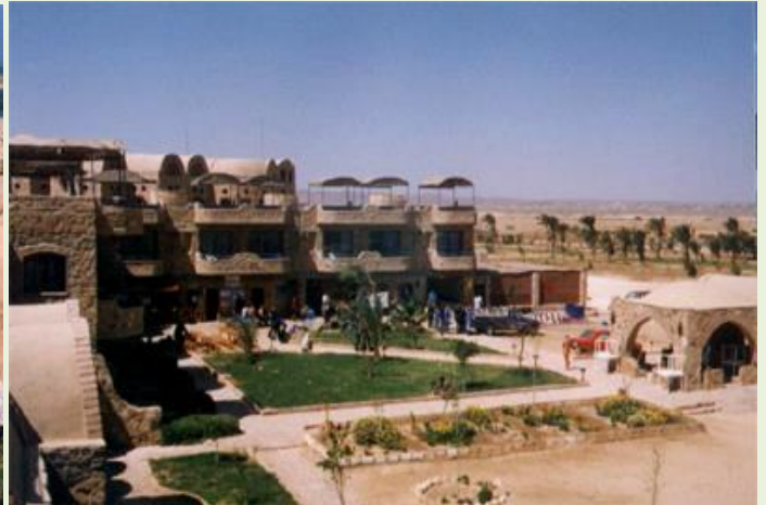
Another view of the hotel and dive shop.