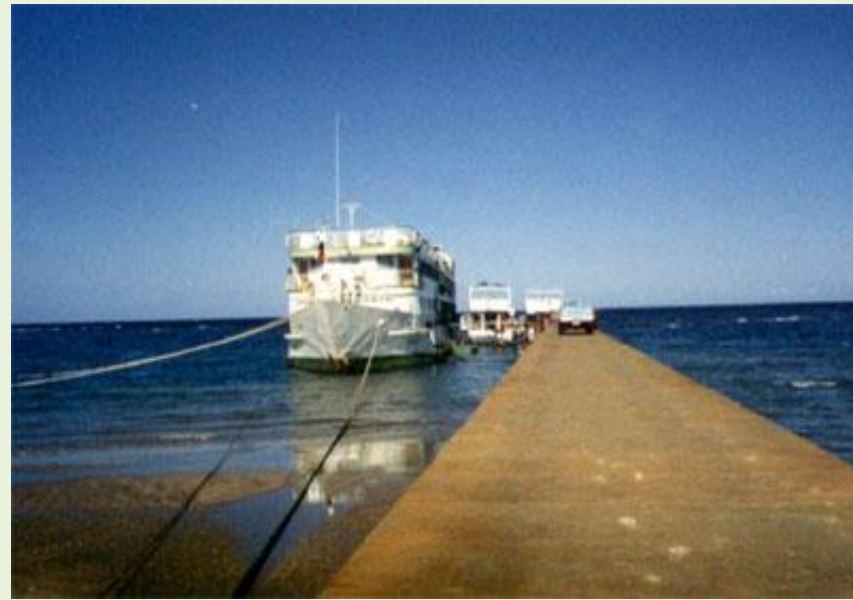
Jetty at Quseir