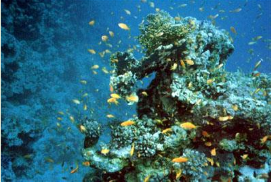
Anthias around a coral block