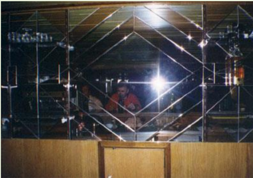
The bar of the Pensee, We spent a lot of time here as there was not a lot else to do. once the days diving was finished.