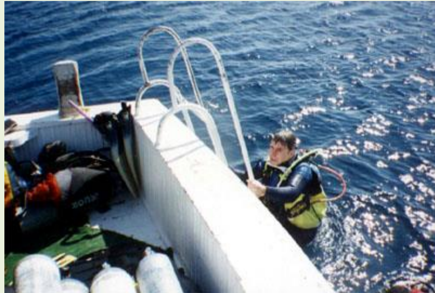
Me climbing back aboard the dive boat. Note the ladder over the side rather than the more normal stern platform.