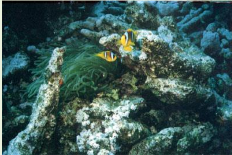
Clown Fish in a small Anemone