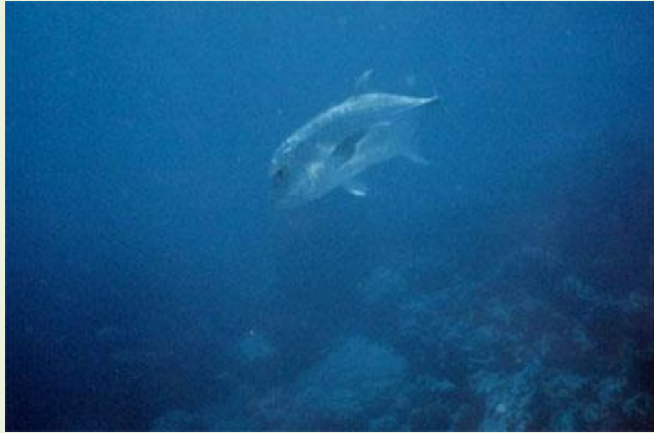
Small Tuna - still quite a big fish