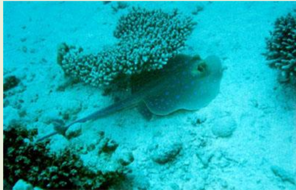
Bluespot trying to hide under a coral head