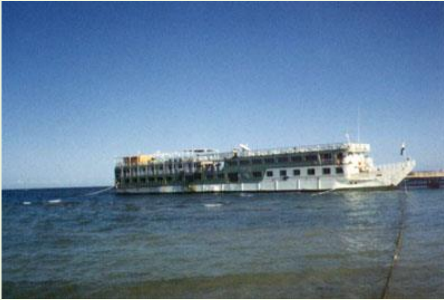
The Nile cruiser Pensee