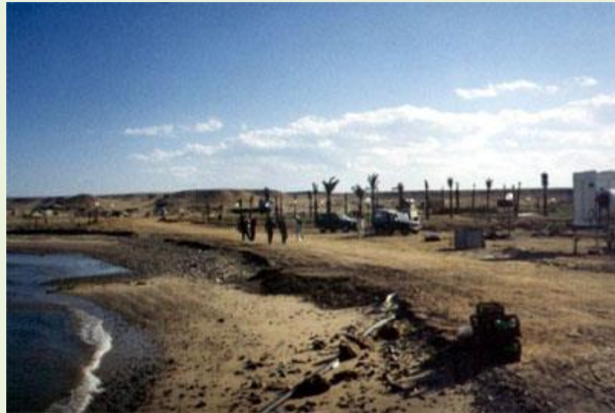
The beach at Quseir. you can see the site of the hotel in the background