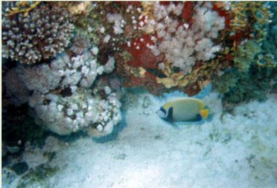
Emperor Angel Fish