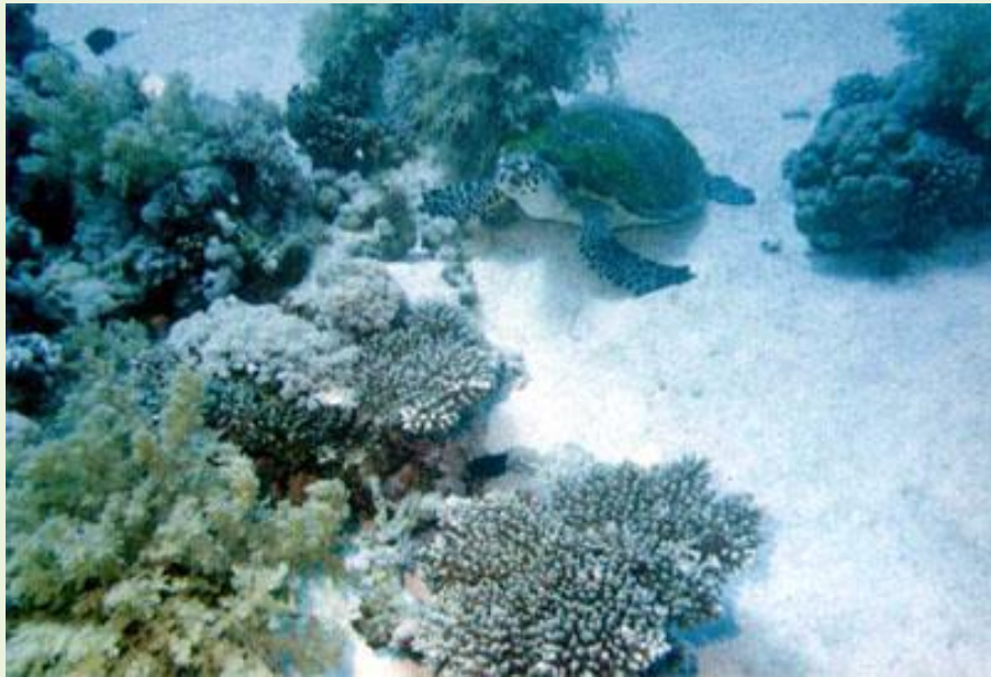
Nice corals with a turtle in the background