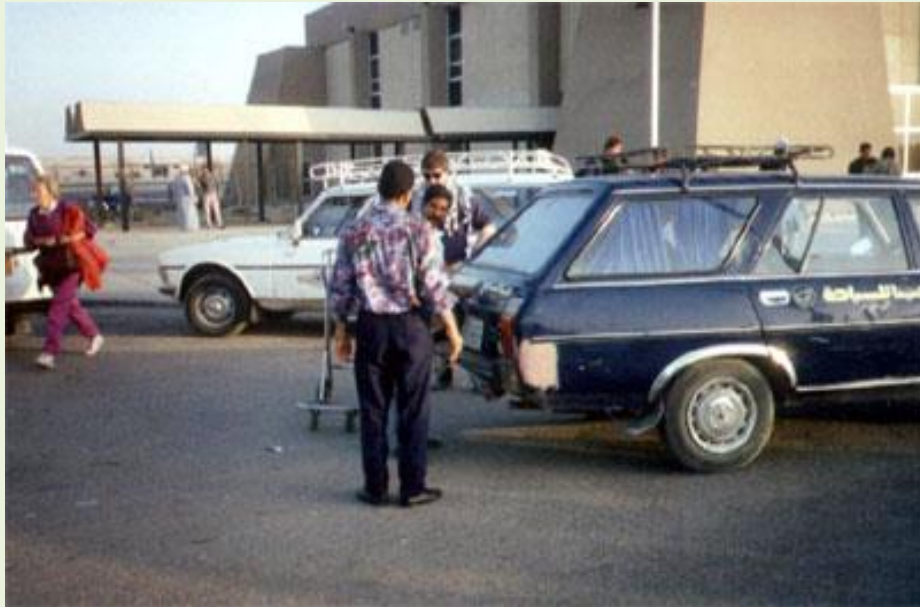
Arriving at Luxor airport - the taxi driver spoke no English