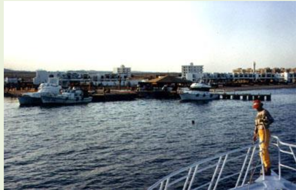
The Menaville jetty