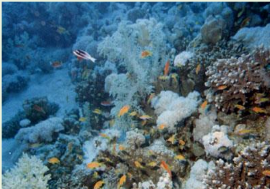
Corals and Antheas