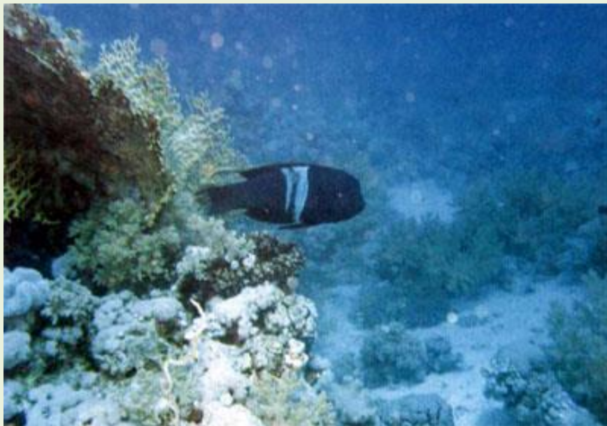
No idea what this guy is but he' s quite cute