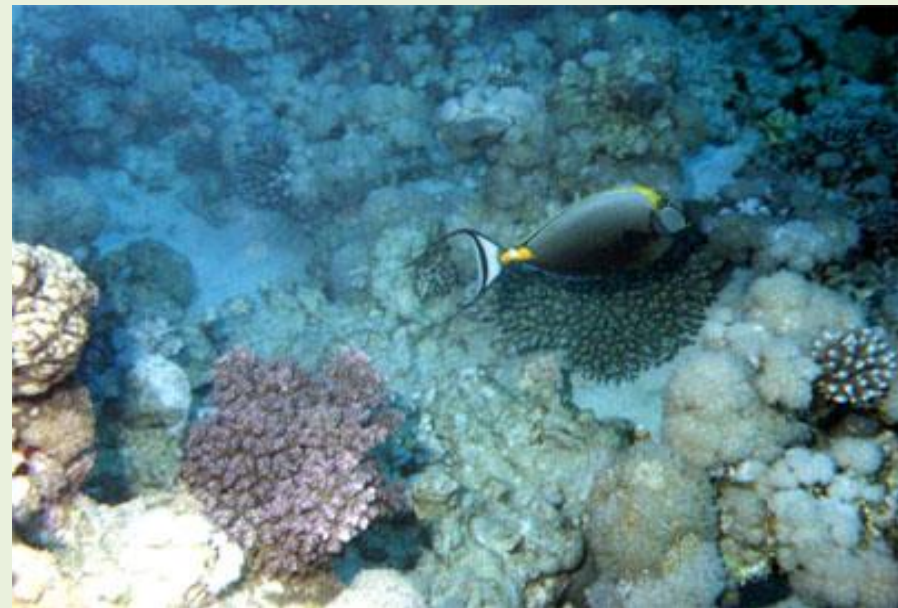
Surgeon Fish of some flavour