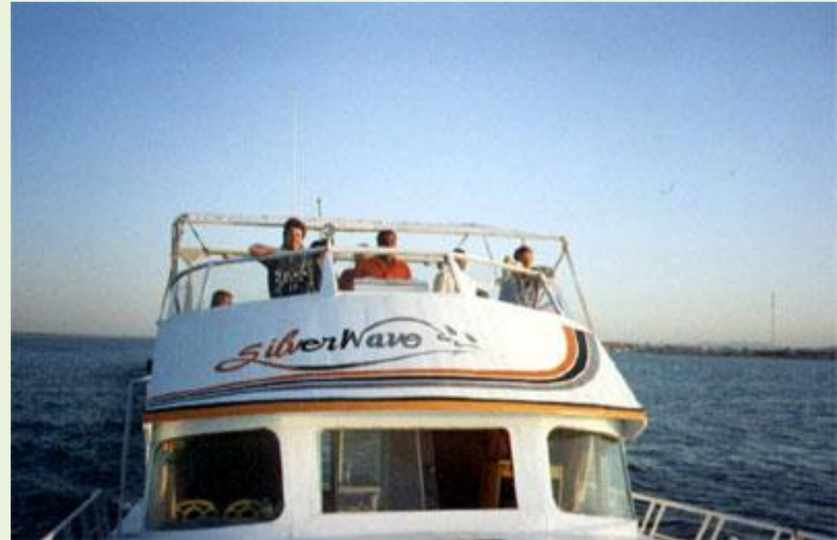
Our boat the Silver Wave