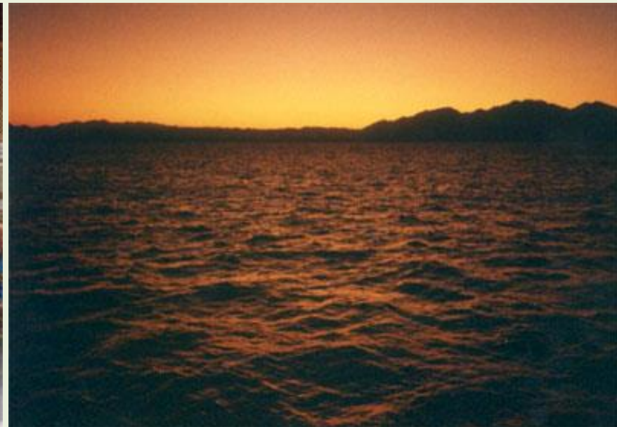
Sunset over Safaga