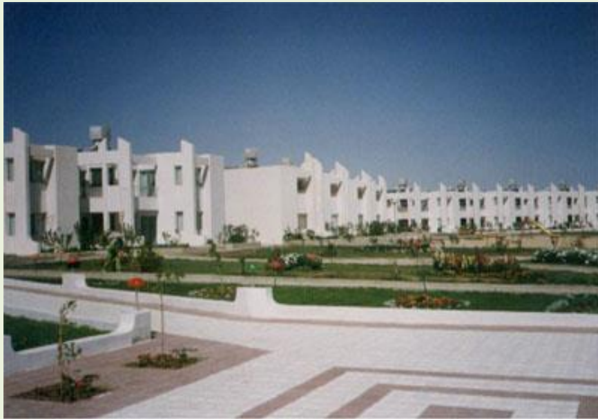
Menaville Hotel Gardens