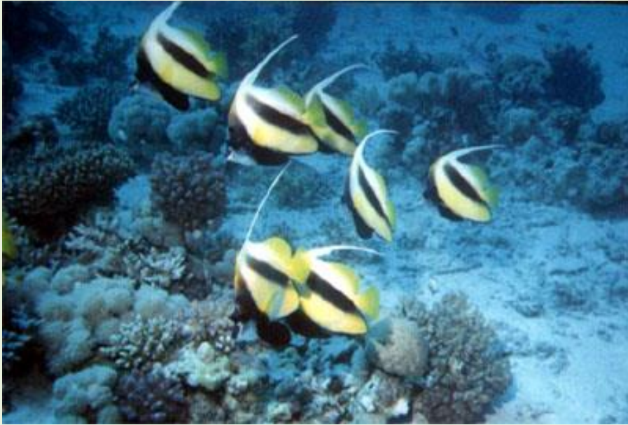
Small school of bannerfish