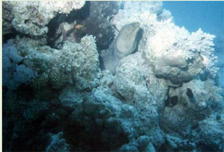
The Moray under the boat.