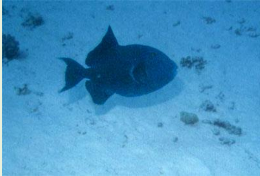
Large Blue Trigger fish, can be quite aggressive