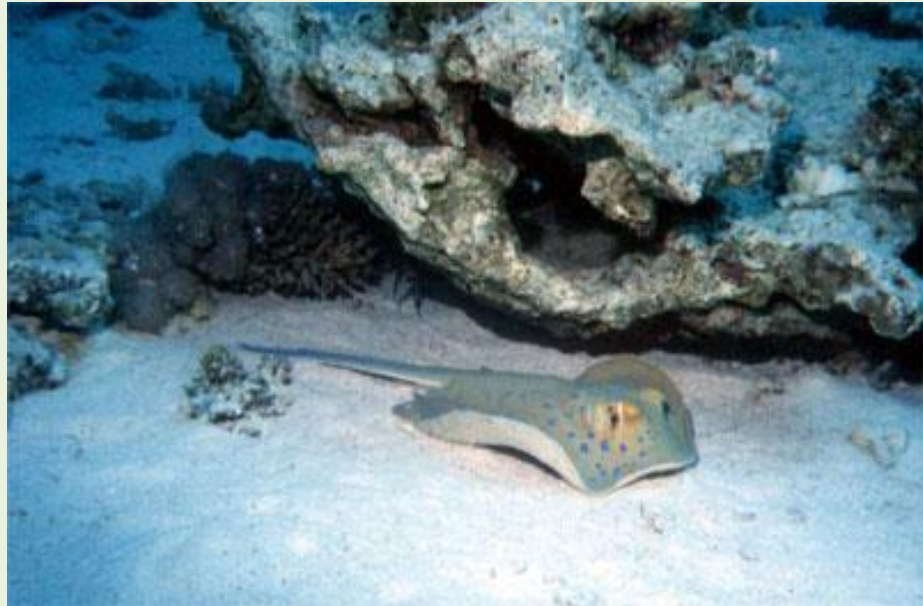
Blue Spot about to take flight