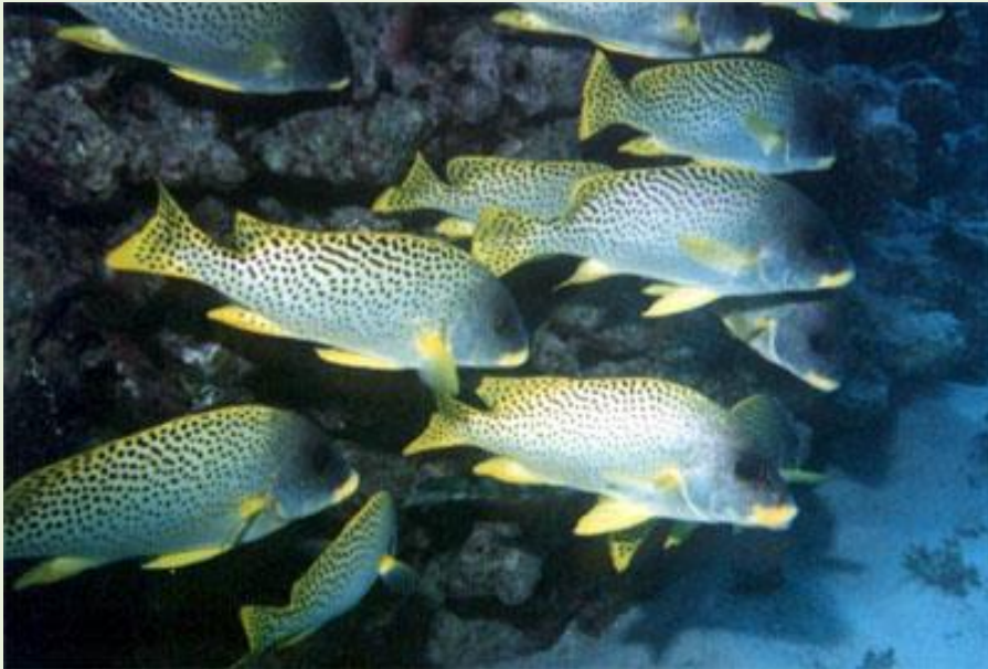
School of Sweetlips