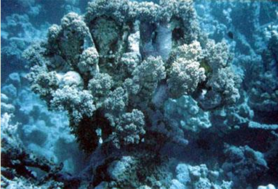
Cauliflower soft corals