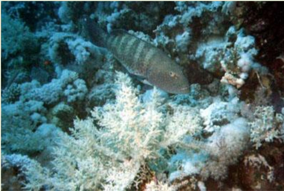
Emperor Angel Fish