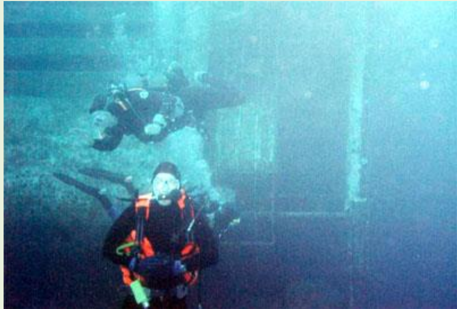
Divers on the Salem Express