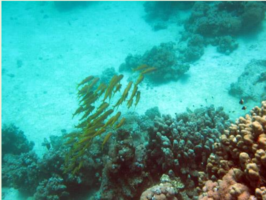
Shoal of goatfish at Abu Galawi where we did our check dive