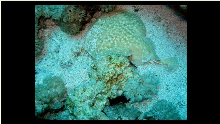
Small Ray seen at Rocky of a type unknown and not seen before