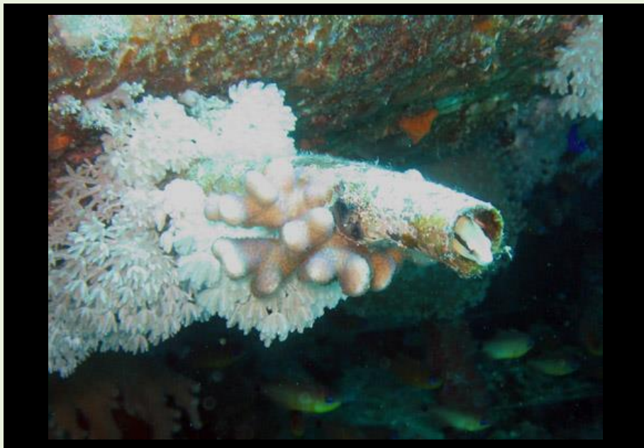
Gobi hiding in the end of a pipe