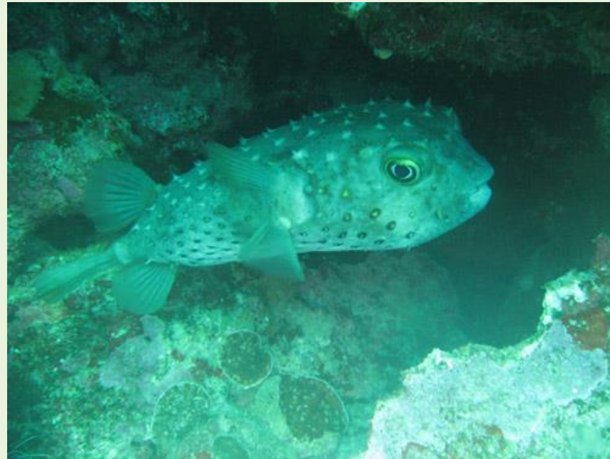
Big Boxfisf at Daedelus