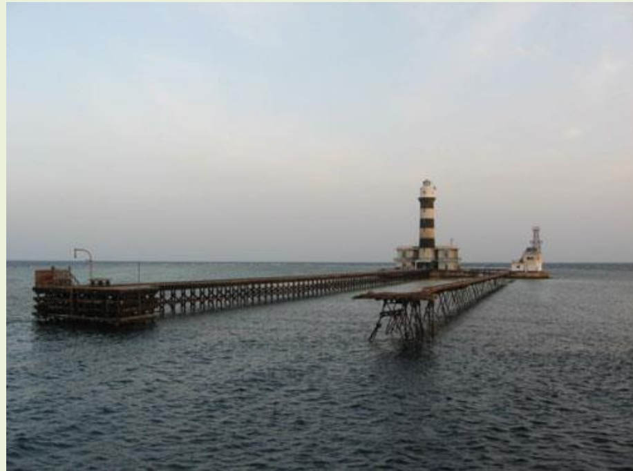
The lighthouse on Daedalus Reef