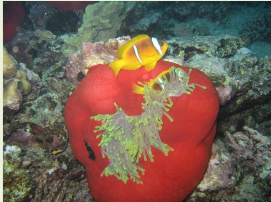
An anemone inside out, something I had rarely seen before but very common at UmmAsk reef