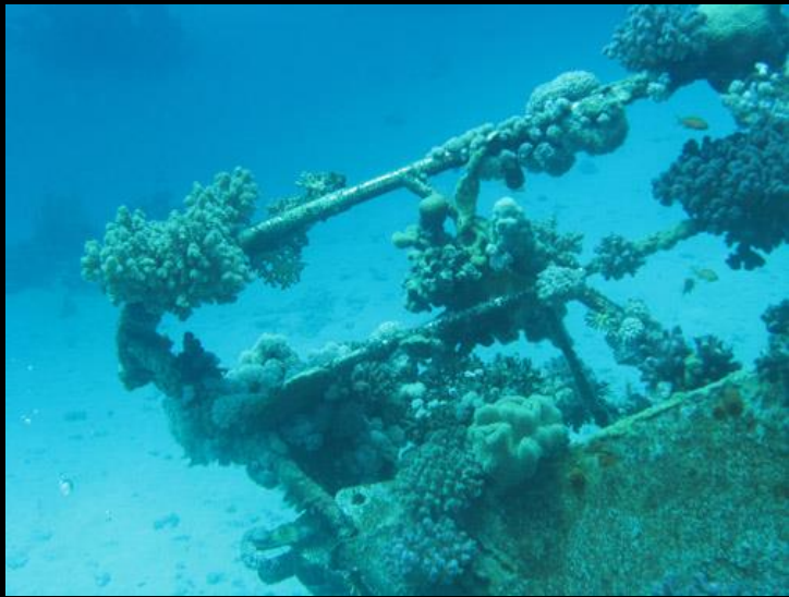
The sunken yacht at El Shona Reef