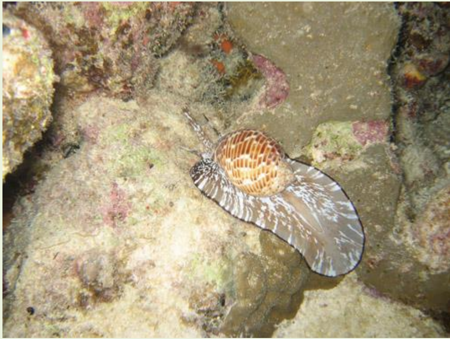
Large Snail found on night Dive at Wadi Gimal