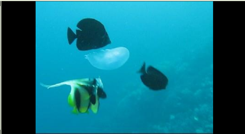
An unforunate jellyfish being munched on by bannerfish and butterfly fish