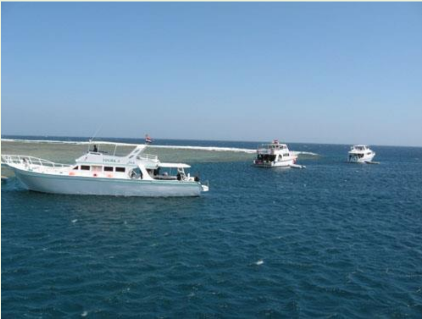
The reef edge at Abu Dhabab

The Coral Beach Hotel waterfront with Port Ghalib marina in the background. The video clip is the scenery leaving Port Ghalib