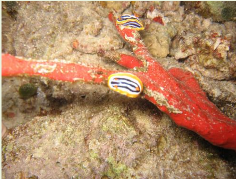
A couple of pyjama nudibranchs found on a night dive at Wadi Gimal