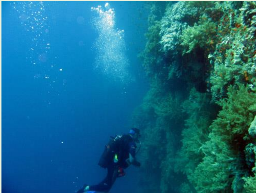
The reef wall at Daedelus