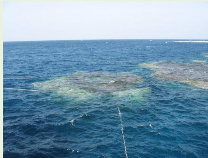
The mooring at Shaab Claudia