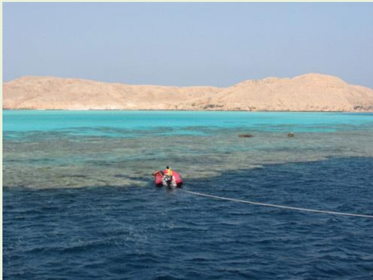
Mooring at Rocky Island