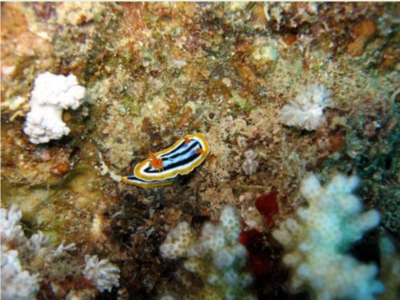
Nudibranch on Giannis D