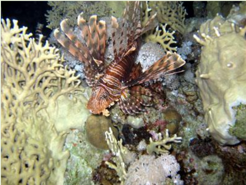
Lion Fish on the prow during a night dive