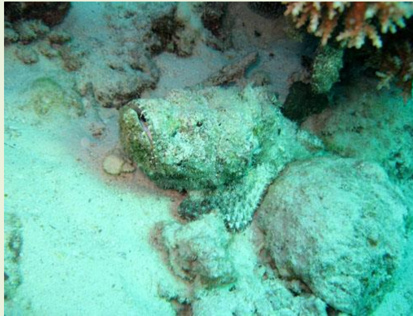
Another small Stone Fish