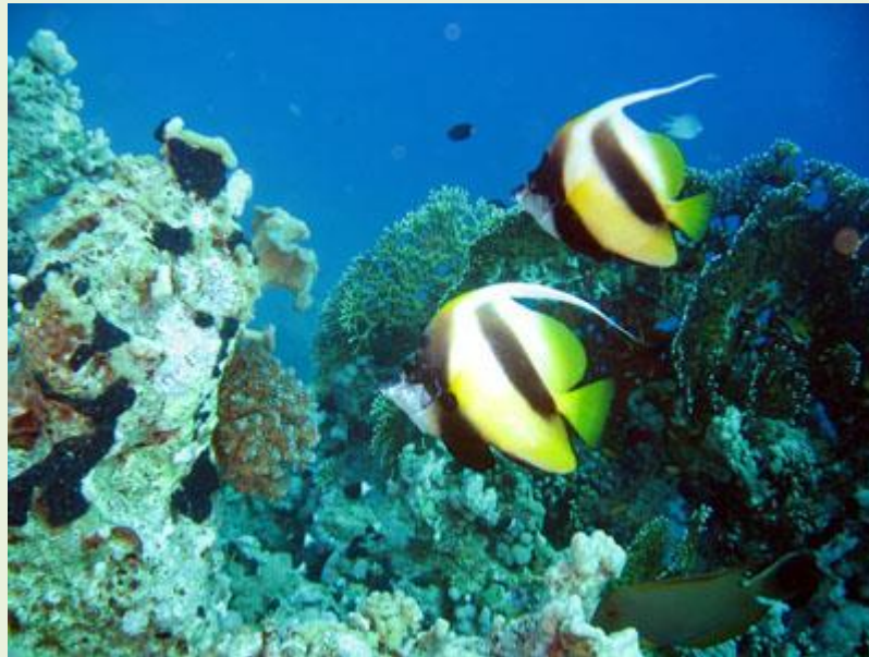
Angel fish at Ras Mohammed