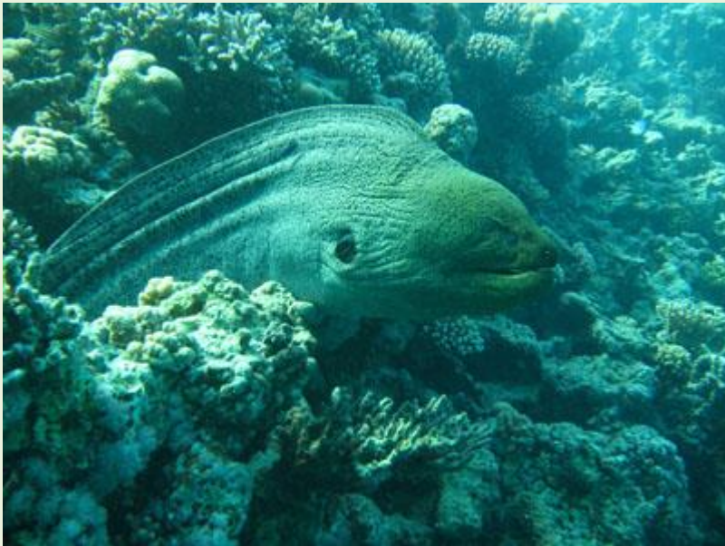
Nice big Moray on our first dive of the trip too