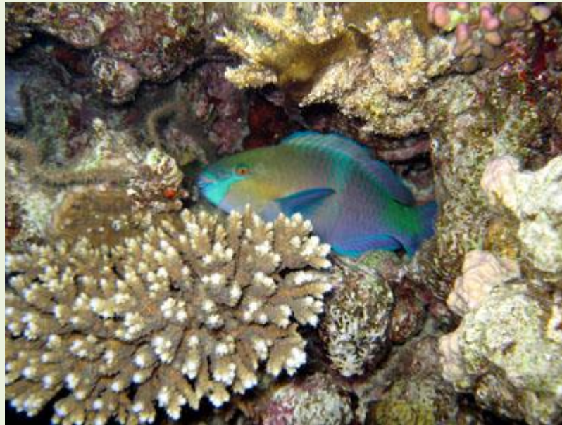
Parrot Fish trying to get some sleep