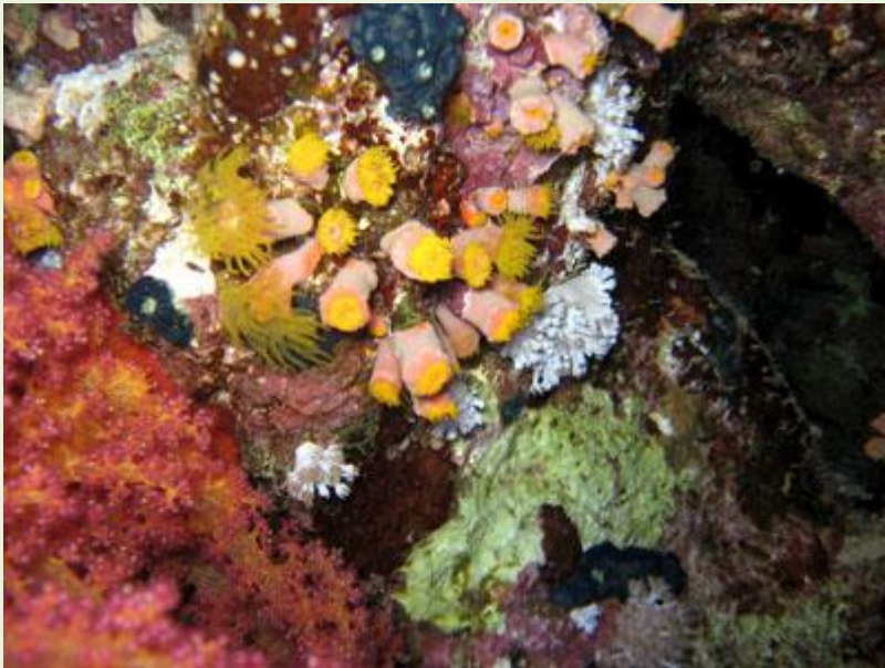
Nice orange soft corals - The Alternatives