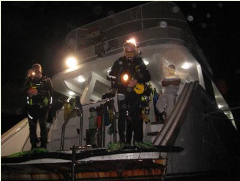
Jumping in for a night dive