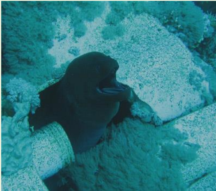
Moray with cleaner wrasse in its mouth - Yolanda Reef