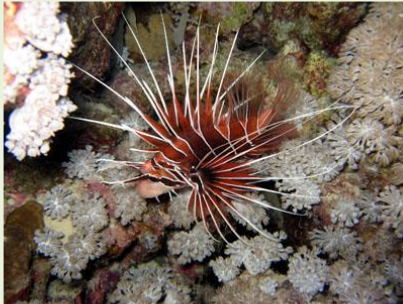
Lion Fish on the prow during a night dive