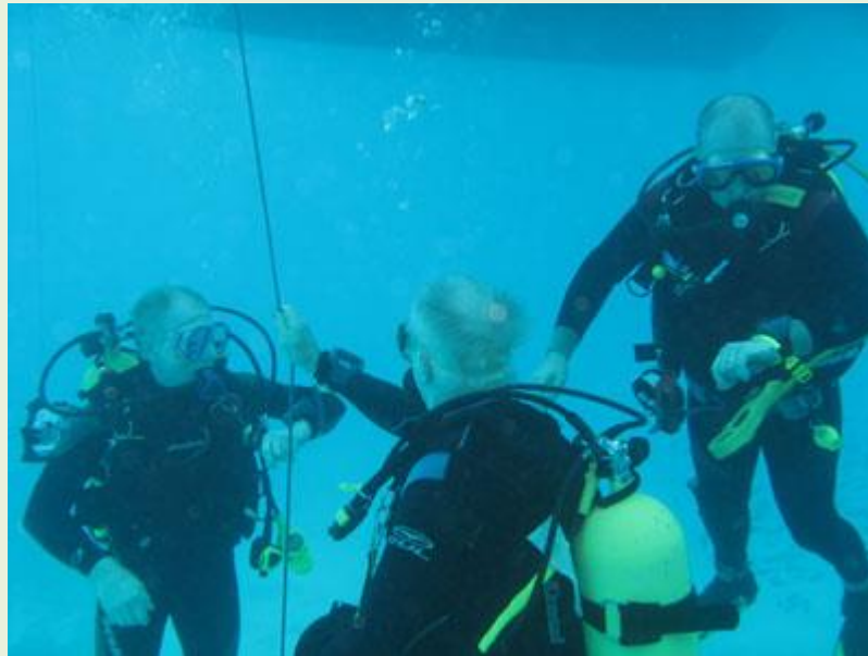
Hanging on the line after our first dive