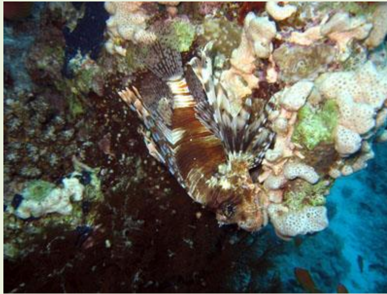
Lion Fish trying to get some sleep during the daytime./