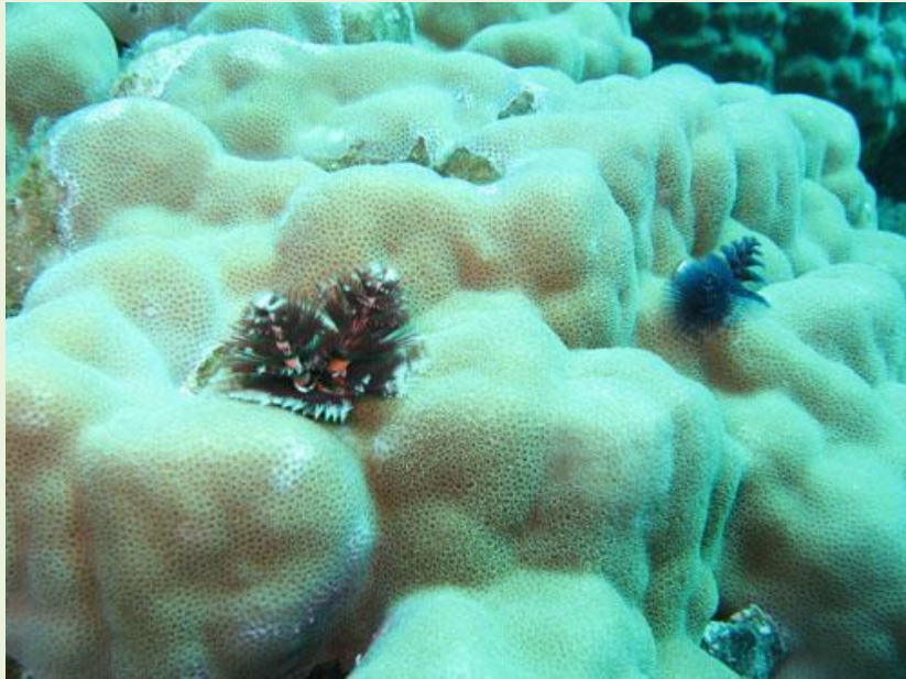
Christmas Tree Worms