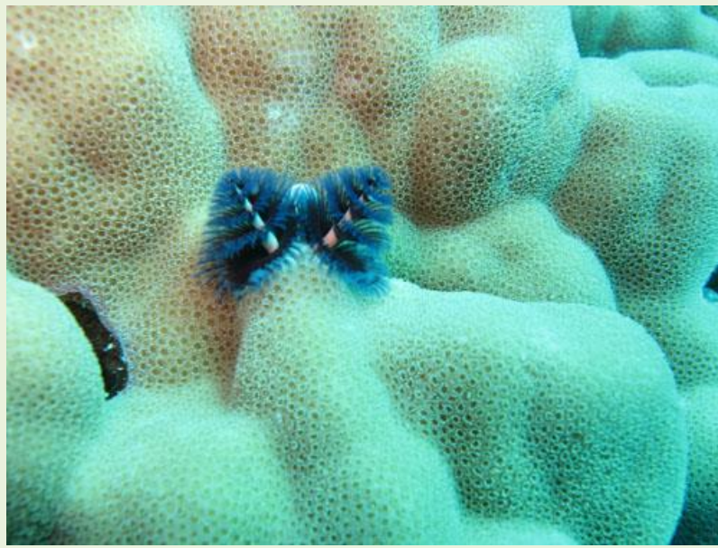
Christmas Tree Worm