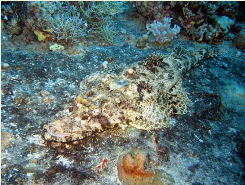
Crocodile Fish on the deck of the Markos