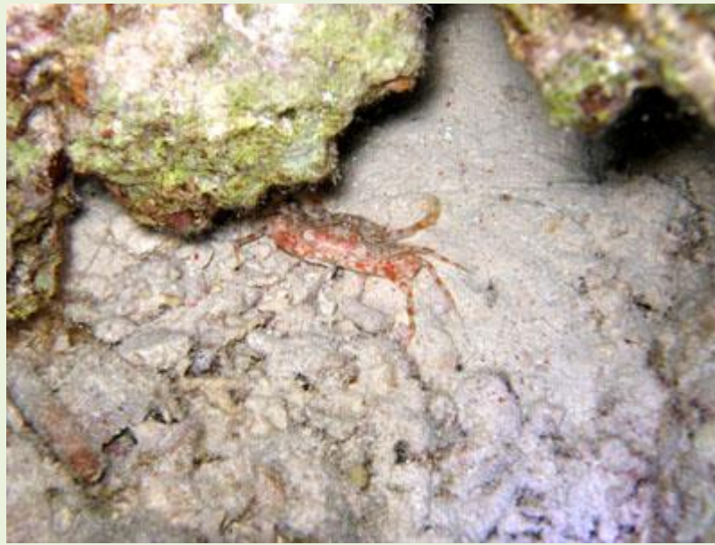
Small crab ay The Alternatives