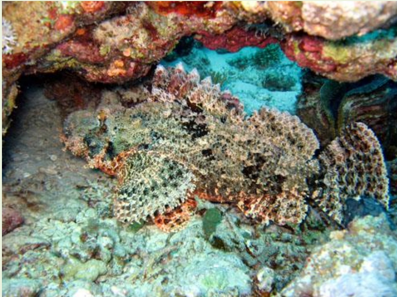
Scorpion Fish on Bluff Point