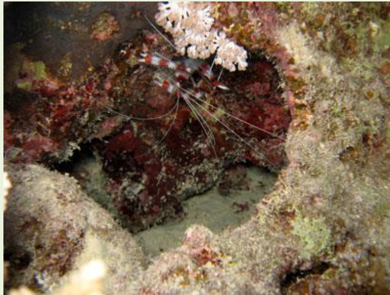
Banded Shrimp - The Alternatives