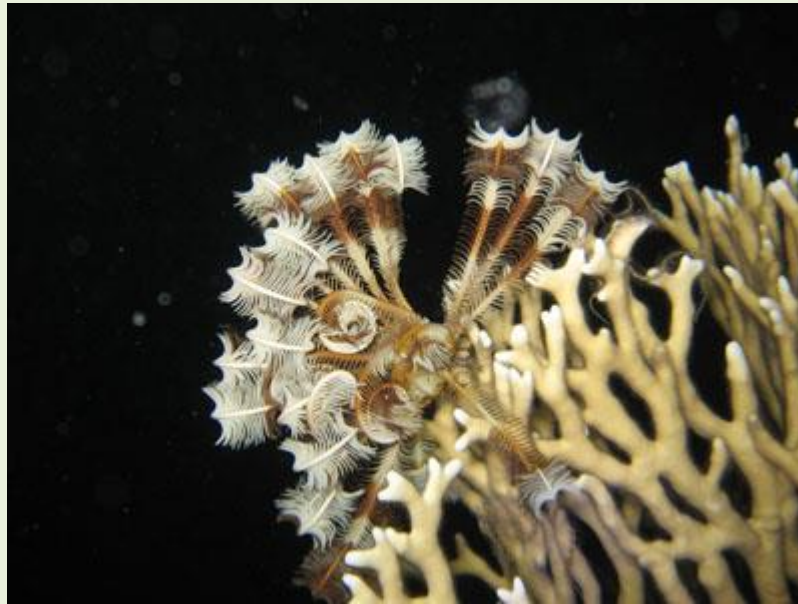
Featherstar on night dive