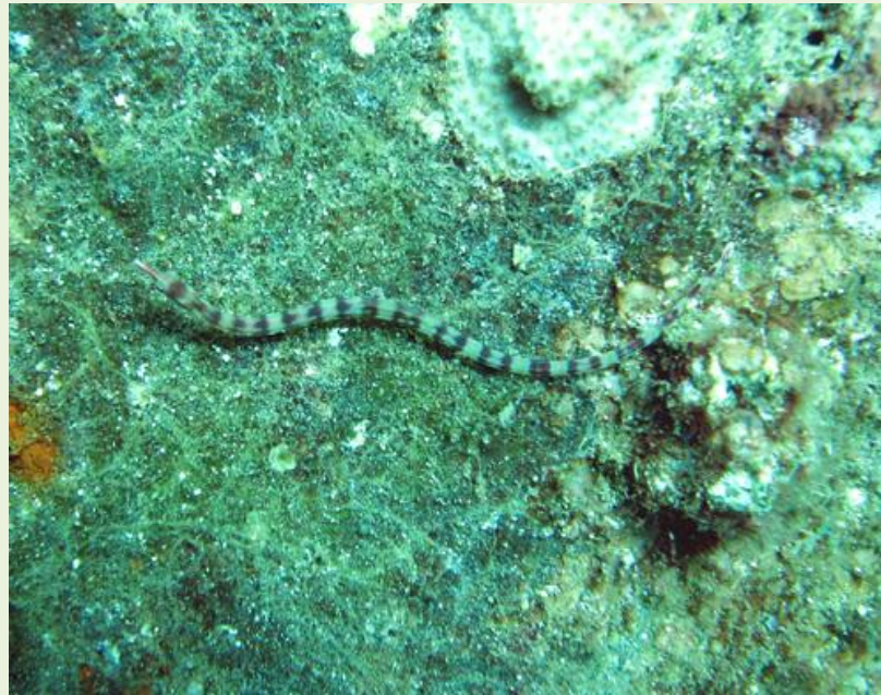
Another small pipe fish