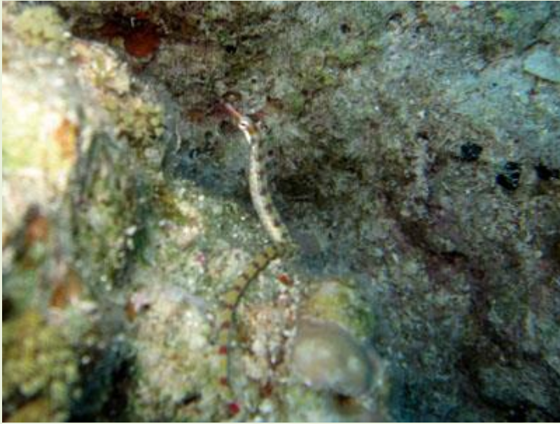
Small Pipe Fish