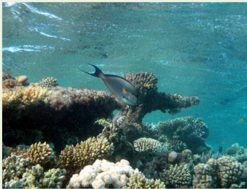
Surgeon Fish on top of the reef at Small Passage