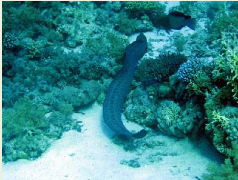
Free swimming Moray on Yolanda