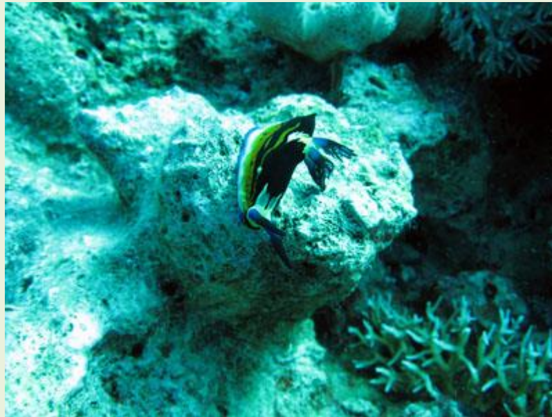
Nudi branch, not sure what flavour