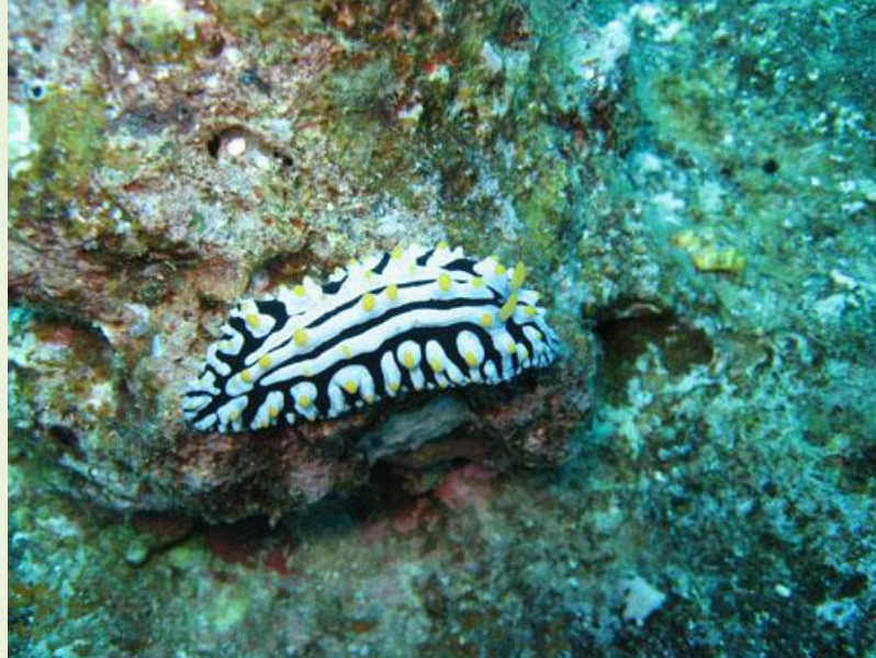
Nudibranch on the Markos