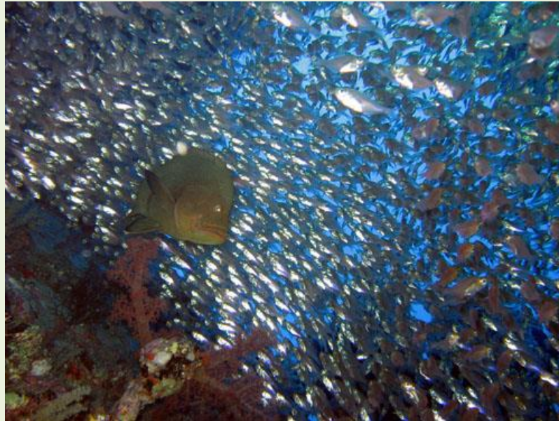
Grouper minding his flock of glass fish inside the Carnactic