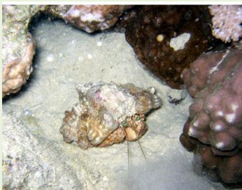
Helmet Crab on Beacon Rock night dive