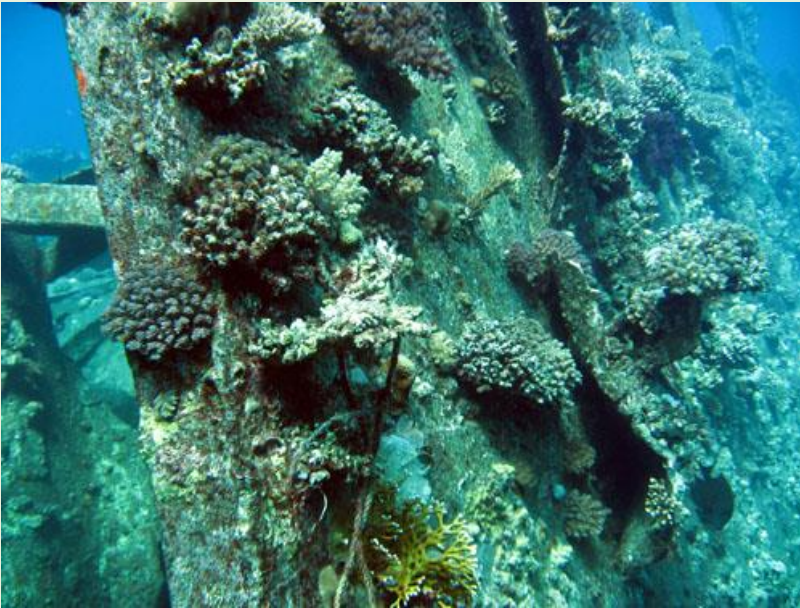
Side of the Carnatctic with lovely hard Corals