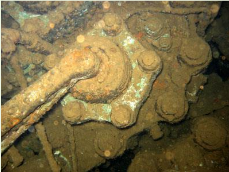
Rocker Arm and valve spring on the Giannis D engine, The rocker arm is about 1 meter long overall