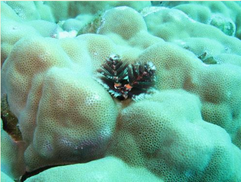
Christmas Tree Worm