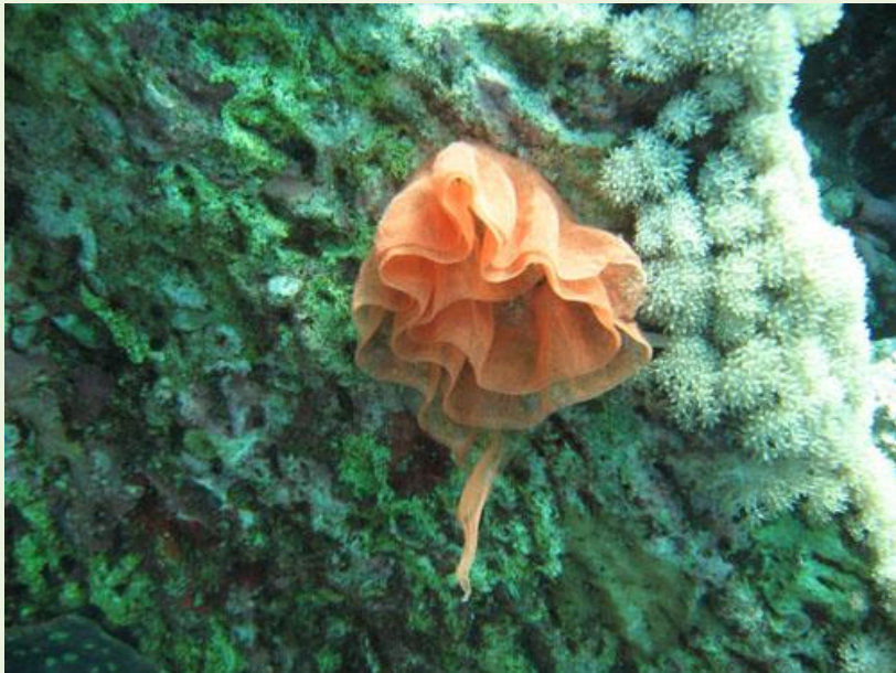
Not a piece of muslin but an egg case from a Spanish dancer