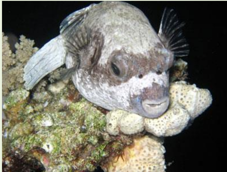
Small puffer fish sleeping on top of a coral