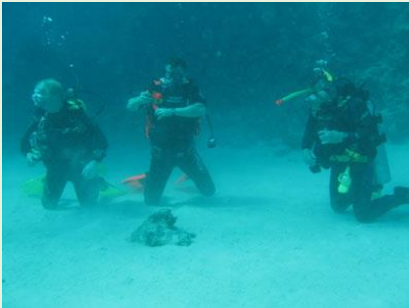
Doing our check dive tests